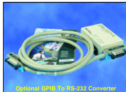
Optional GPIB To RS-232 Converter