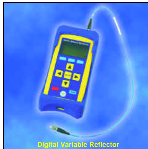
Digital Variable Reflector