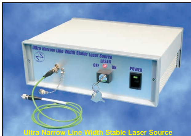
Ultra Narrow Line Width Stable Laser Source