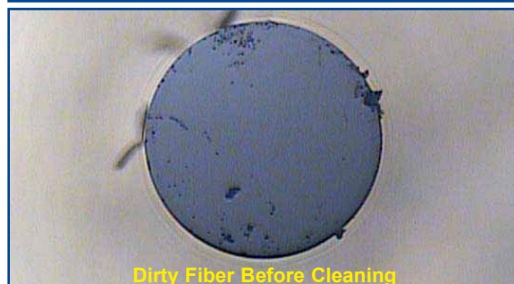
Dirty Fiber Before Cleaning