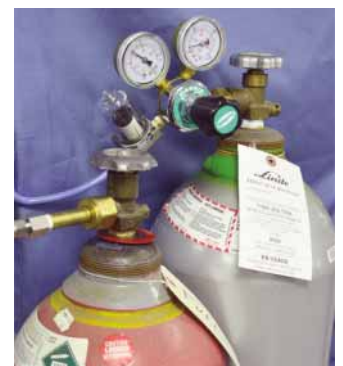
CO 2 & N 2 Cylinders, typical gas supply (USA) connection shown.