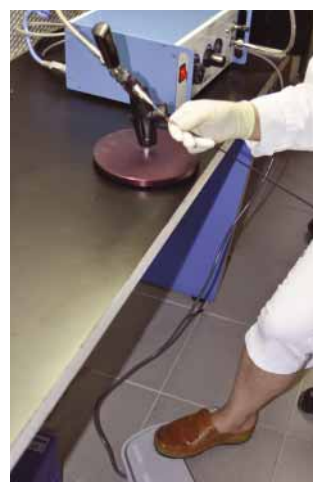
OZPEN cleaning high power patchcord.