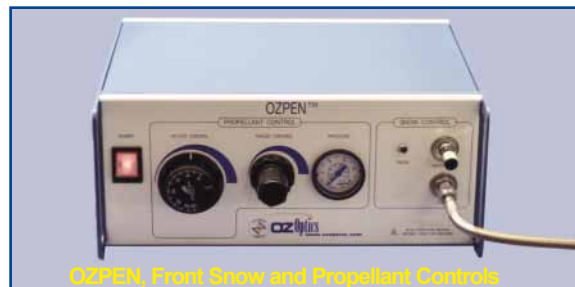
OZPEN, Front Snow and Propellant Controls

Each OZPEN is equipped with a flexible coaxial tube, spray pen applicator, and foot switch. The basic system provides precision cleaning capability right out of the box and includes all components for precision cleaning apart from the process gases.