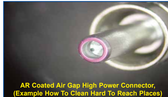
AR Coated Air Gap High Power Connector, (Example How To Clean Hard To Reach Places)