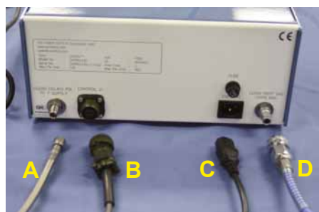
Back of the unit connections A: CO 2 connection (use 9/16" wrench). B: Foot pedal connection. C: Power connection. D: Propellant gas, Nitrogen.