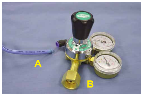
Propellant gas line connection. A: Nitrogen supply B: European DIN connection.