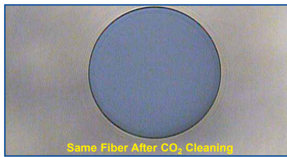
Same Fiber After CO 2 Cleaning