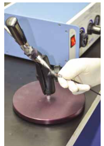
Fiber optic connector cleaning - close up.