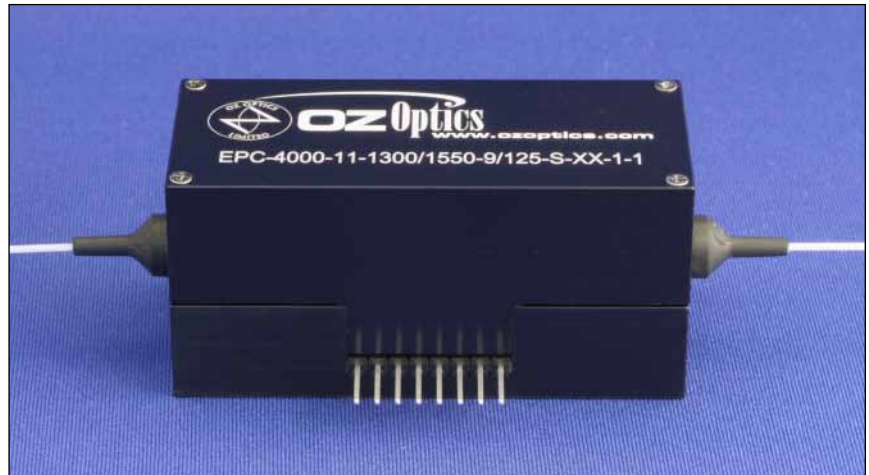
High Speed Polarization Controller-Scrambler