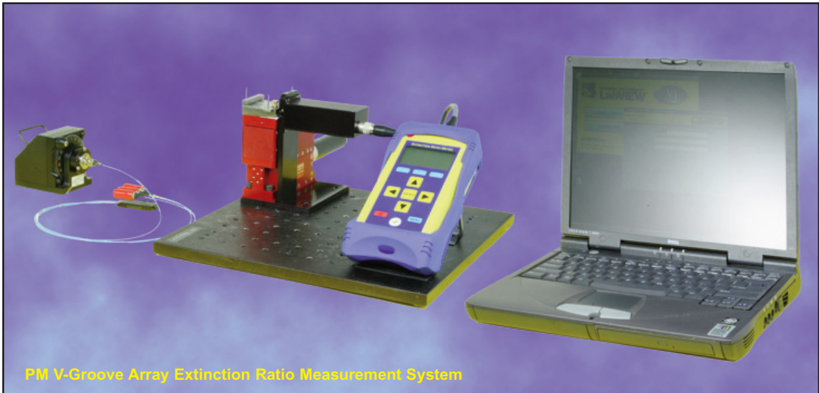
PM V-Groove Array Extinction Ratio Measurement System

The system works by first setting the software configurations for the appropriate V-Groove size and spacing. The V-Groove chip is then attached to the mounting stage and the opposite end of the fiber is attached to the polarized source. After adjusting the stage to roughly align the fiber to the meter, the software is started to take the ER measurement and automatically move the array to the next fiber position. Manual recording of the measured ER and angle is required at this point, optional software is available to log the measurements for later use. At the software prompt, the user must change the fiber on the polarized stable source so the next measurement can be taken.