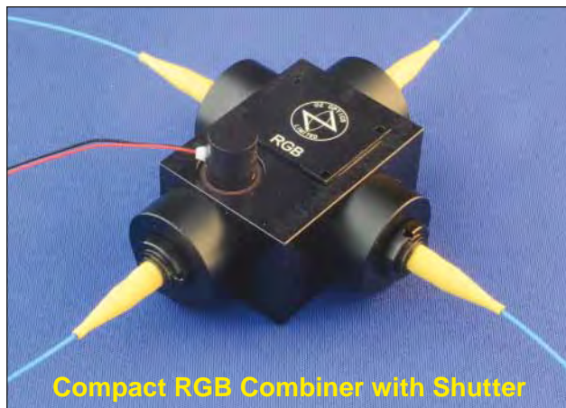
Compact RGB Combiner with Shutter