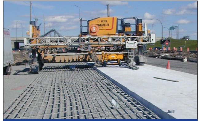
Highway Safety Monitoring