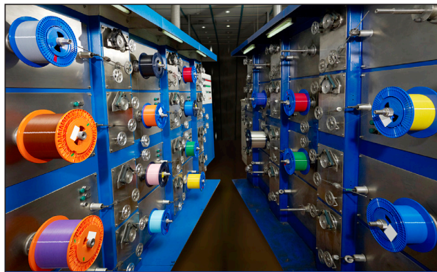
Quality Inspection of Fiber Optic Cable