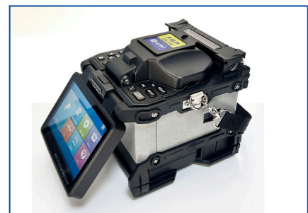
Fiber fusion splicer - FSP-100-S/M