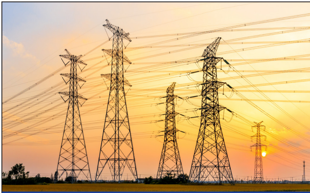
Overhead Power Line Monitoring