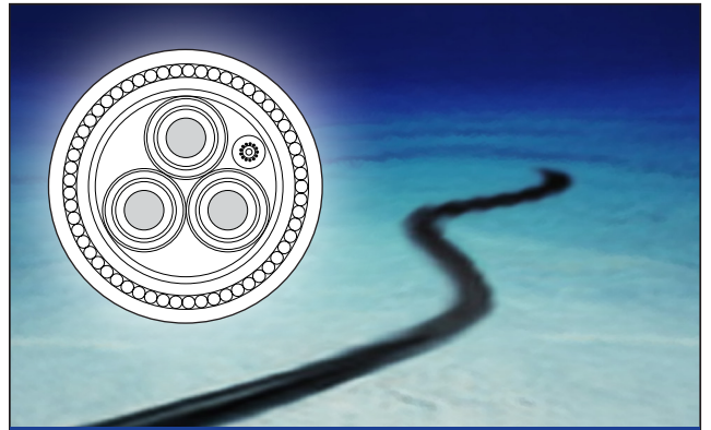
Submarine Cable Monitoring