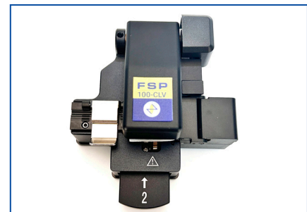
Precision fiber cleaver - FSP-100-CLV