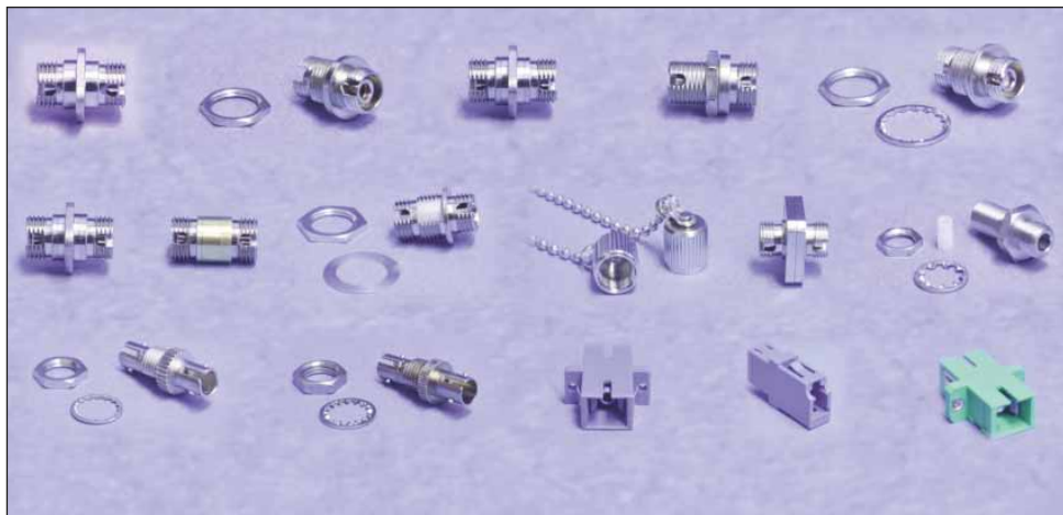
Sleeve-thru adapters for ultra, super, or angled connectors