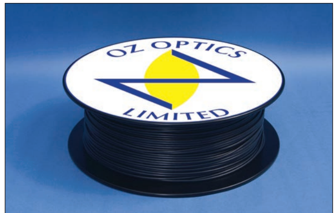
3mm OD Cabled Fiber