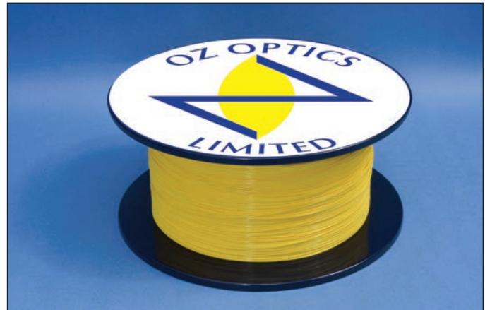
900 micron OD Fiber