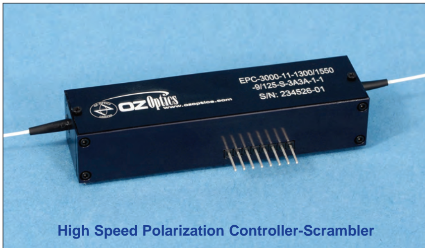
High Speed Polarization Controller-Scrambler

OZ Optics' High Speed Electrically Driven Polarization Controller (EPC) provides a simple, efficient means to quickly manipulate the state of polarization within a singlemode fiber. Employing a