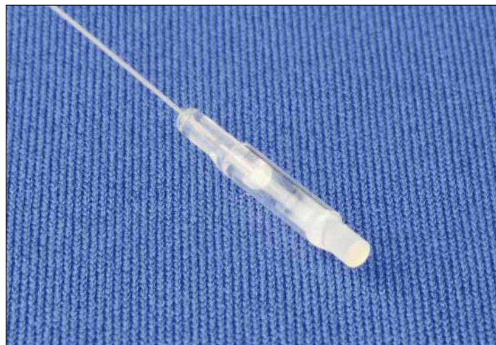
Fused fiber collimator

As these products demonstrate high power handling, parts are an ideal match for fiber laser systems and associated parts such as isolators, filters, beam splitters and combiners, as well as inside integrated assemblies. OZ optics offers these fused fiber collimators as a specialty item, and for detailed specifications please contact us at sales@ozoptics.com