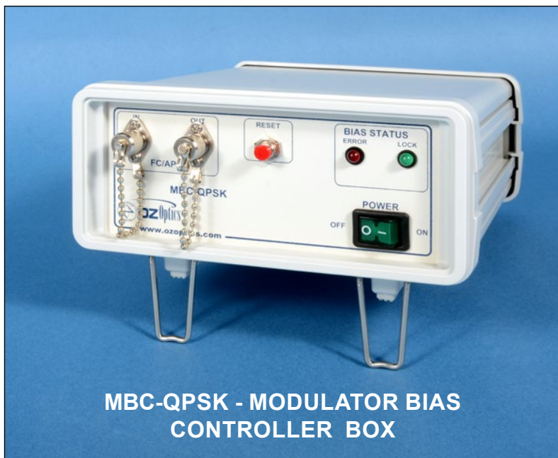
MBC-QPSK - MODULATOR BIAS CONTROLLER BOX