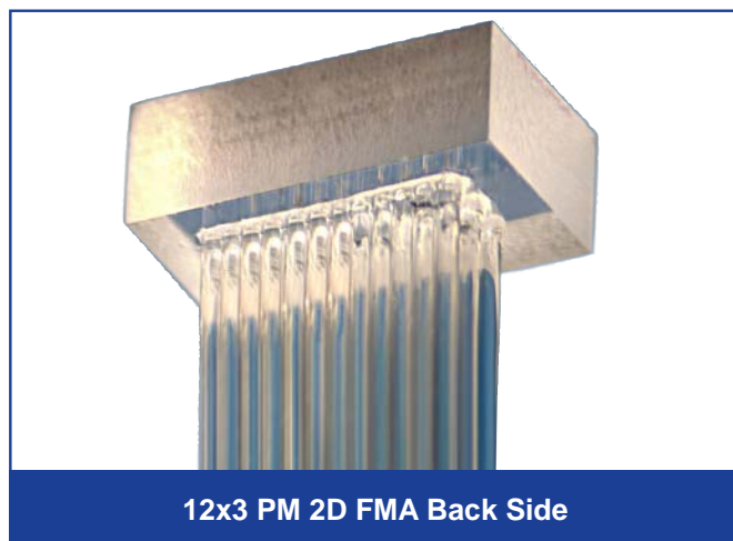
12x3 PM 2D FMA Back Side